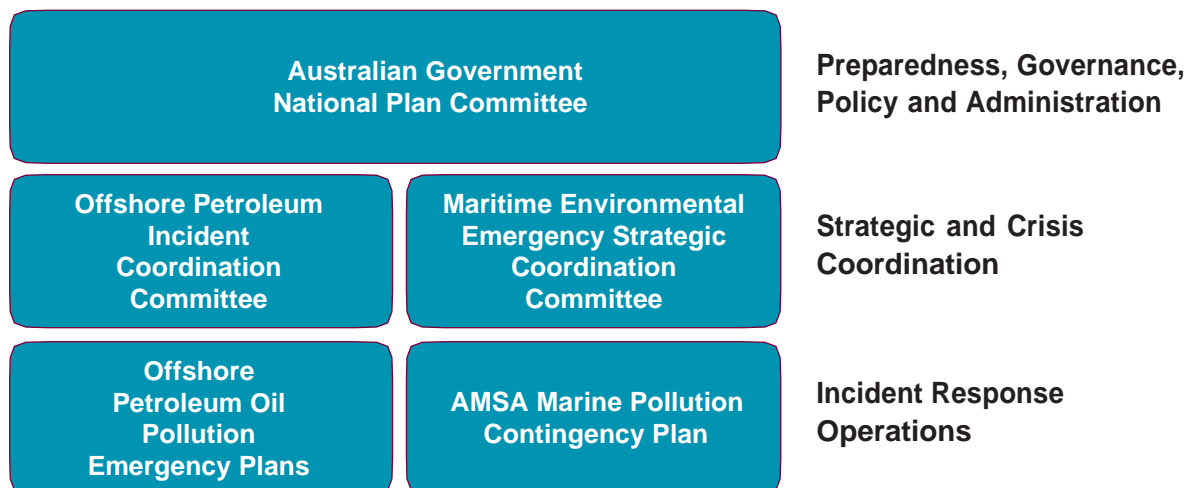
Figure 2 – Governance Model for the Australian Government Coordination Arrangements

This Arrangement works within the governance arrangements of the National Plan for Maritime Environmental Emergencies. The Australian Government National Plan Committee (AGNPC) is responsible for ensuring the Australian Government is prepared to respond to maritime environmental emergencies. Figure 2 describes the Governance model.