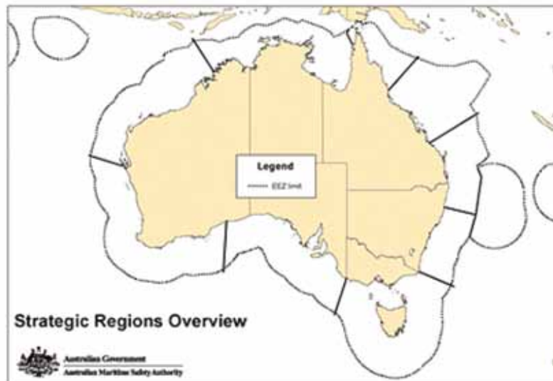
Figure 1: ETV strategic regions

The emergency towage capability consists of a three-tiered approach, as described below: