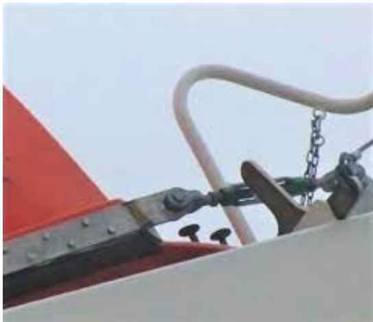
Simulation Bottle Screw